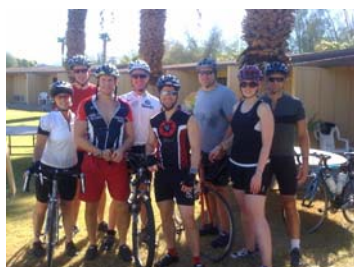
2009 Illinois Death Valley Riders *Some riders not pictured*

Thank you for your participation in the 2009 Ride to Cure Diabetes.